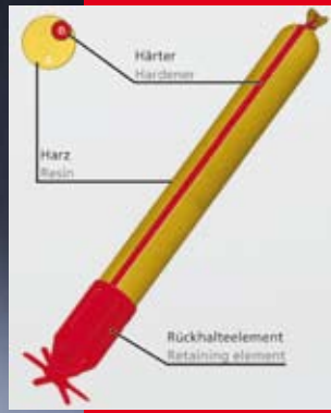
Lokset SiS resin capsules