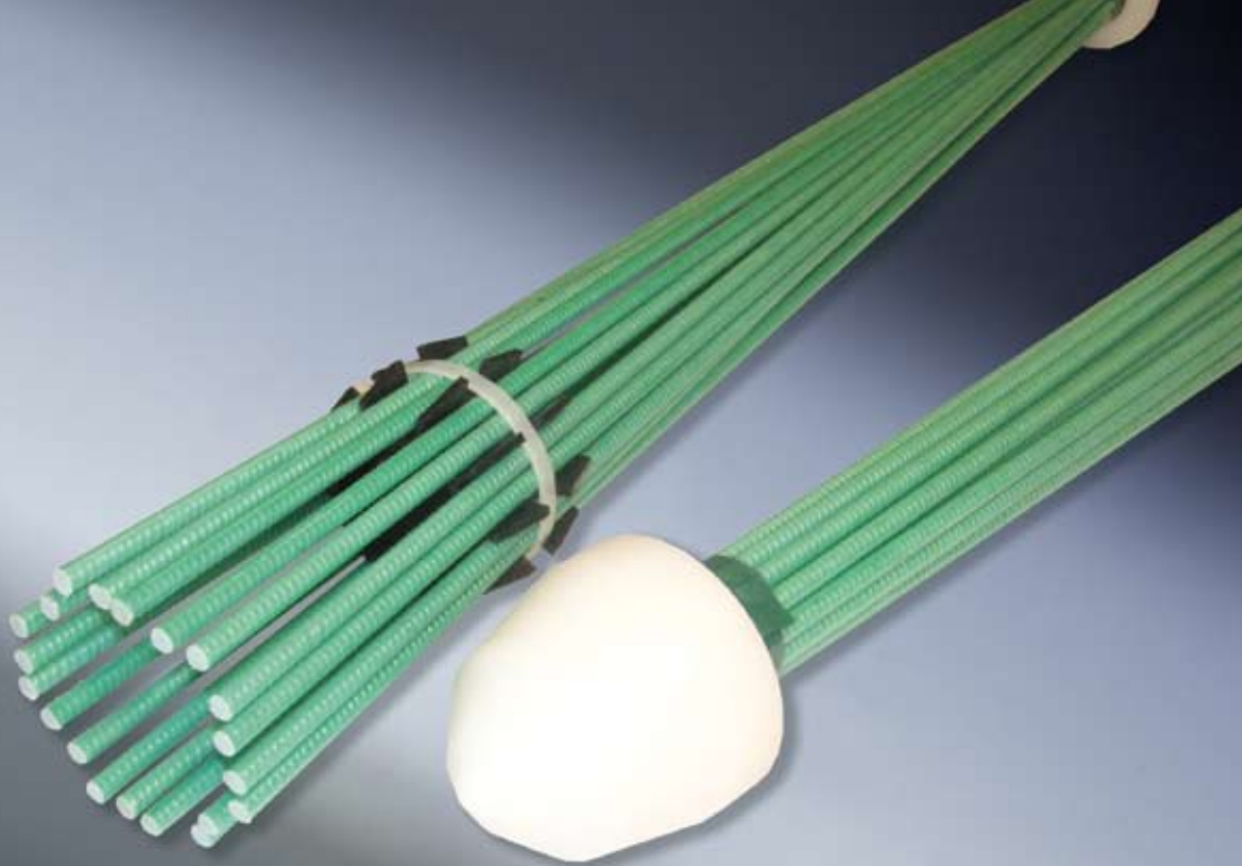
CABLEX GRP Cable Bolts