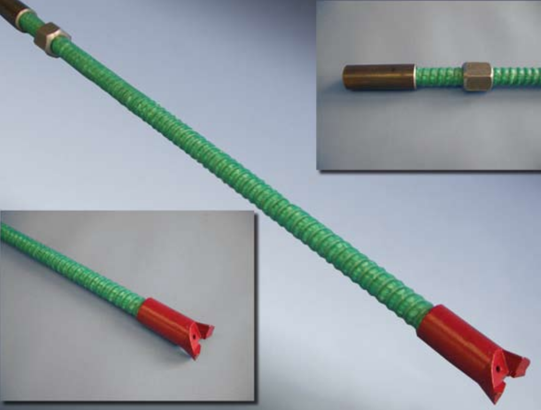
SPINMAX Self-drilling Bolt with drill bit, coupling and nut